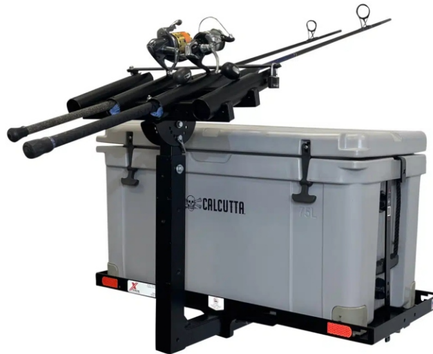
*Shown with optional Fixed Wing Post and cargo rack

Models: Angle-R Bracket Only/Angle-R Post 8