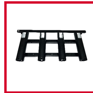
4 Rod Holder with Lock Bar